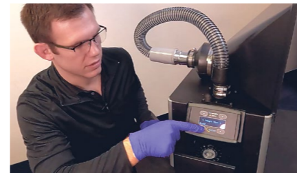
BioFlash BIO • PATHOGENS • CANARY

This smart, hand-held, solid and liquid chemical identifier utilises Fourier-Transform Infrared Spectroscopy (FT-IR) to detect unknown chemicals, solids or liquids. It performs analysis in one minute or less through its ATR diamond sensor and has long range, embedded RF wireless transmission suitable for soldiers in the hotzone who need to communicate data to the command post. An optional ClearSampler accessory adds further capabilities for decon verification, explosive analysis and hazardous materials assessment.