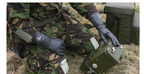
GID-3 CWA • TIC • IMS

Optimised to detect in vapor mode the peroxides used in home-made explosive devices, the SABRE 5000 also reveals trace particles of narcotics, CWAs and TICs. Utilising Ion Mobility Spectrometry (IMS), it can expose and recognise over 40 threat substances – making each identification in approximately 20 seconds.