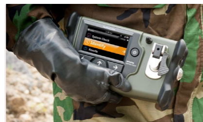
HazMatID Elite CWA • TIC • EXP • NARC • FTIR

The LCD 3.3 is our most versatile product for chemical agent detection meeting the demands of many different military applications. It detects a variety of chemical warfare agents (CWAs) and Toxic Industrial Chemicals (TICs) using our advanced, proven IMS technology. By adding different accessories, it can be transformed to suit various roles in theatre such as personal protection, vehicle integration or in conjunction with robots. It can also be used in a UAV application.