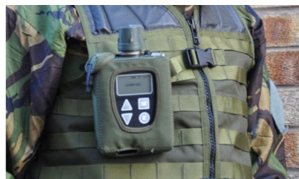
LCD 3.3 CWA • TIC • IMS

Our comprehensive range of solutions fulfills a wide variety of requirements for detection and identification.