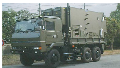
PBDS BIO • INTEGRATED SYSTEM

Offering superior identification capabilities, RadSeeker accurately detects and identifies masked nuclear threat materials, assesses the source found, and provides a risk assessment describing the source as benign or a threat.