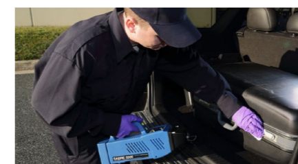
SABRE 5000 WA • TIC • EXP • NARC • IMS

A portable, non-radioactive desktop system for detecting and identifying trace amounts of explosives, the IONSCAN 600 is very versatile. It is suitable for use out in the field or at a fixed base.