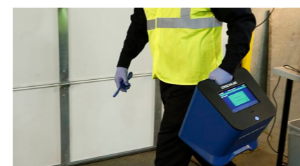
IONSCAN 600 EXP • NARC • IMS

Chemical Biological Protective Shelter (CBPS) and highly mobile medical shelter. It is designed to military specifications, is highly resistant to chemical and biological threats and can be used in natural disasters and other emergencies such as a potential terrorist attack or pandemic response. It provides the military a highly mobile, chemical/biological agent-free environment and safe haven for patients in which to administer healthcare without the need for protective clothing.