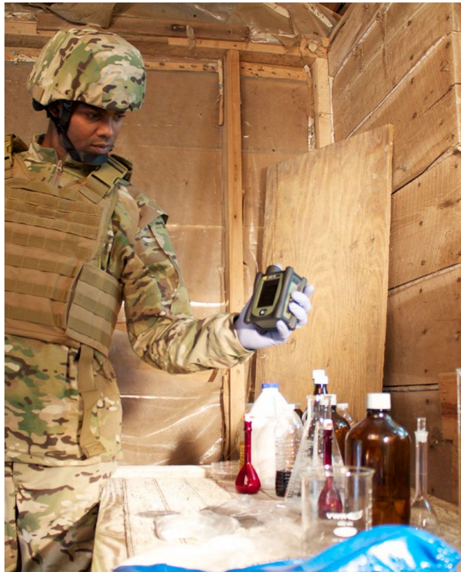
Meeting the demand for detection and identification of CBRNE threats.