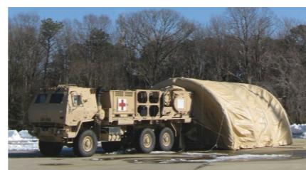
CBPS CHEM-BIO • INTEGRATED SYSTEM

The Precision Biological Detection System (PBDS) is a self contained laboratory designed to detect and identify selected biological agents and provide an alert to the crew. The detection suite component parts are contained within or attached to a container known as the shelter that is mounted on a flatbed vehicle. The system is capable of rapid deployment in theatres of operation under a range of environmental conditions.