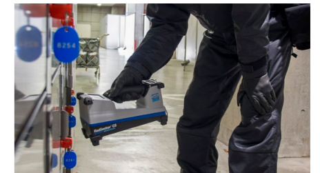
RadSeeker CS/CL/CS-G GAMMA • NEUTRON • RAD

For rapid results in seconds and using just one hand, the ACE-ID is a non-contact explosives identifier for solids, liquids, gels and powders – which can be recognised through translucent and semi-translucent (e.g. plastic or glass) containers. Rugged enough for use in severe climates, it is designed for explosive ordnance disposal technicians, civilian bomb squads and hazmat teams.