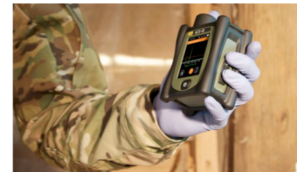
ACE-ID CWA • TIC • EXP • NARC • RAMAN

The BioFlash Biological Identifier is a bio-aerosol collection and identification system. It provides rapid, sensitive and specific identification of various diseases and common biothreat agents including anthrax, ricin, botulinum toxin, black plague, tularemia and smallpox. BioFlash has also been proven to detect airborne SARS-CoV-2 by the United States Army Medical Research Institute of Infectious Diseases (USAMRIID).